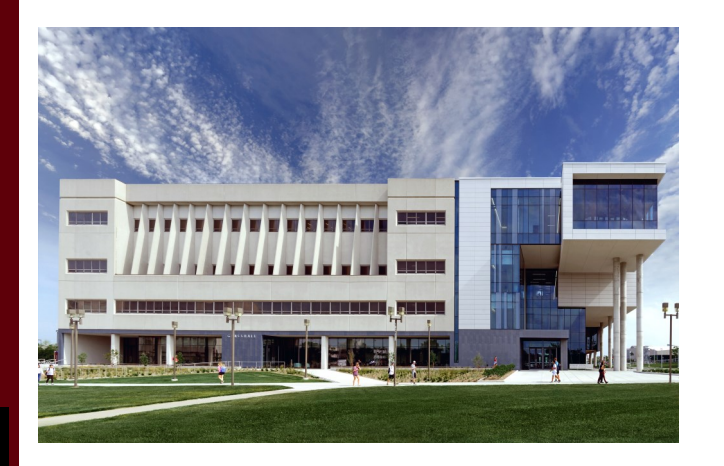
Glass Hall Renovation and Addition completed in October 2017.

An abbreviation for furniture, fixtures and equipment.