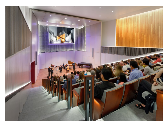
Ellis Hall Renovation completed in September 2017.

The second phase of the architect's basic services wherein the architect drawings other prepares and presentation documents to fix and describe the size and character of the entire project to architectural. as structural, mechanical and electrical systems, materials and other essentials as may be appropriate; and prepares an accurate statement probable of